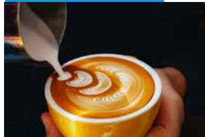
Cafés & Cake Shops