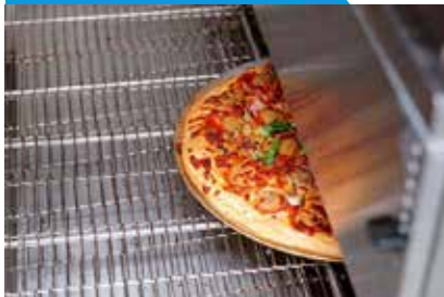
Ice Cream & Juice Bars