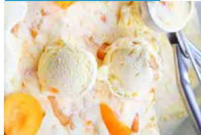
Pizzerias & QSRs