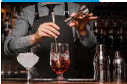
Bars & Pubs