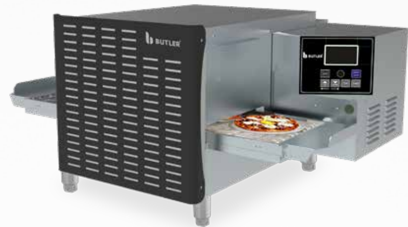
Gusto E - Junior / Gusto G - Junior

This prodigious oven from Butler is out to revolutionise the foodservice industry as it has all the features of its bigger siblings in the Gusto series and yet it offers the convenience of being easily placed on a 700mm deep counter. It comes with a 260mm wide belt, a 430mm x 400mm baking chamber and can bake upto 10" pizzas. What's makes it unique is that it can run on 240Volts/ single phase electricals making it suitable for kiosks, food-courts, food trucks, restaurants and catering applications. It is also designed to cook a variety of other products including bagels, garlic breads, omelettes, sea food and ethnic Indian foods like naans, crisp rotis, Amritsari kulchas, kebabs and more.