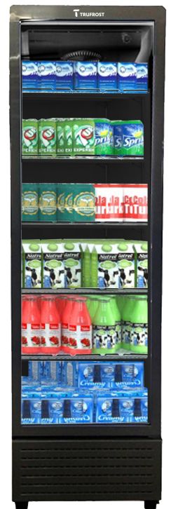
VC 400 Italia