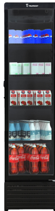
VC 300 Slim Italia