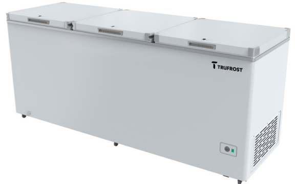
CF 700 TD Premia