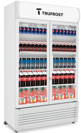
VC 700 NF VC 1000 NF