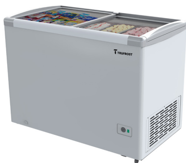
GT 300 Premia