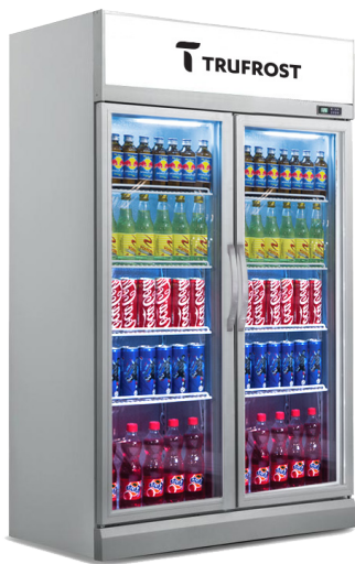
VC 1250 Premia