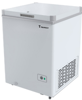
CF 175 Premia, CF 225 Premia