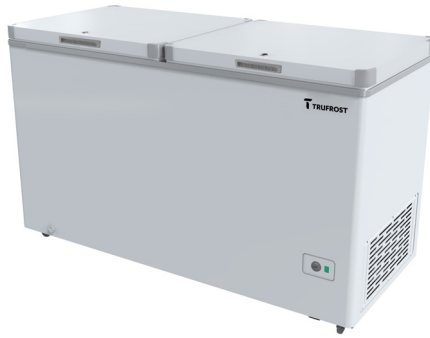
CF 330 DD Premia, CF 440 DD Premia CF 550 DD Premia