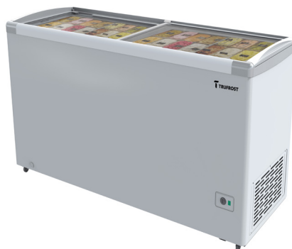
GT 400 Premia