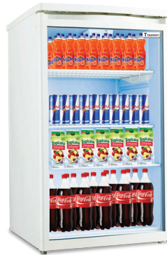
VC 100 (New)