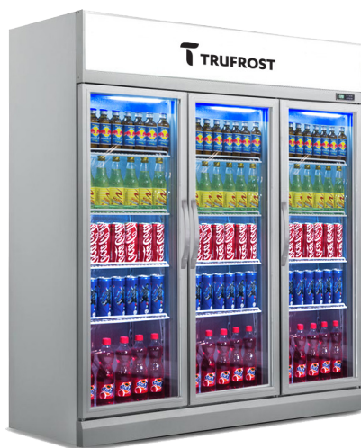
VC 1800 Premia