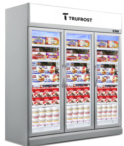
VF 1250 Premia VF 1800 Premia