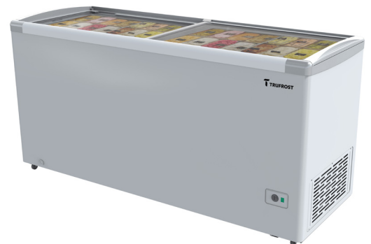
GT 500 Premia