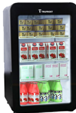
VC 77 Italia